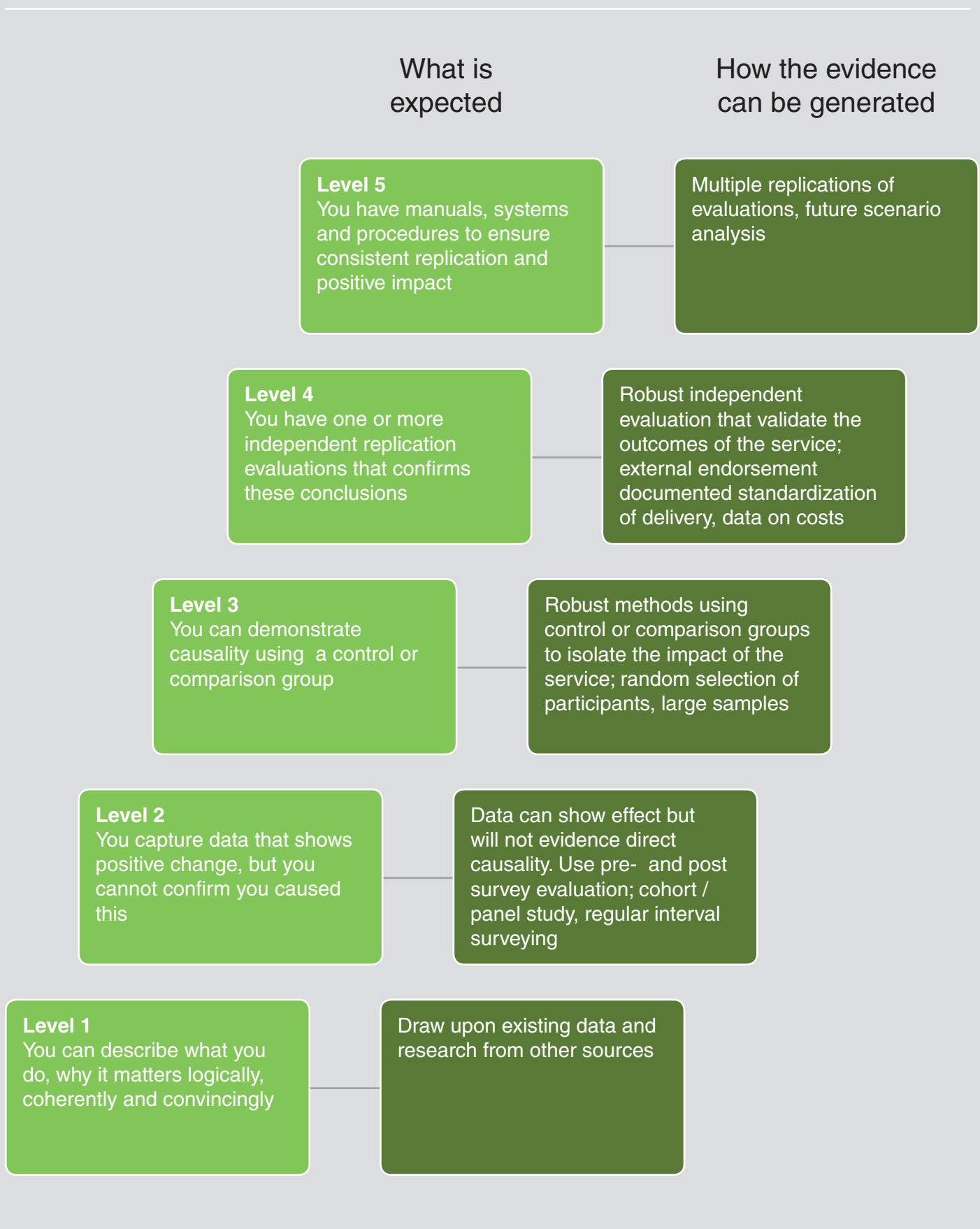
Figure 1: Nesta Standards of Evidence