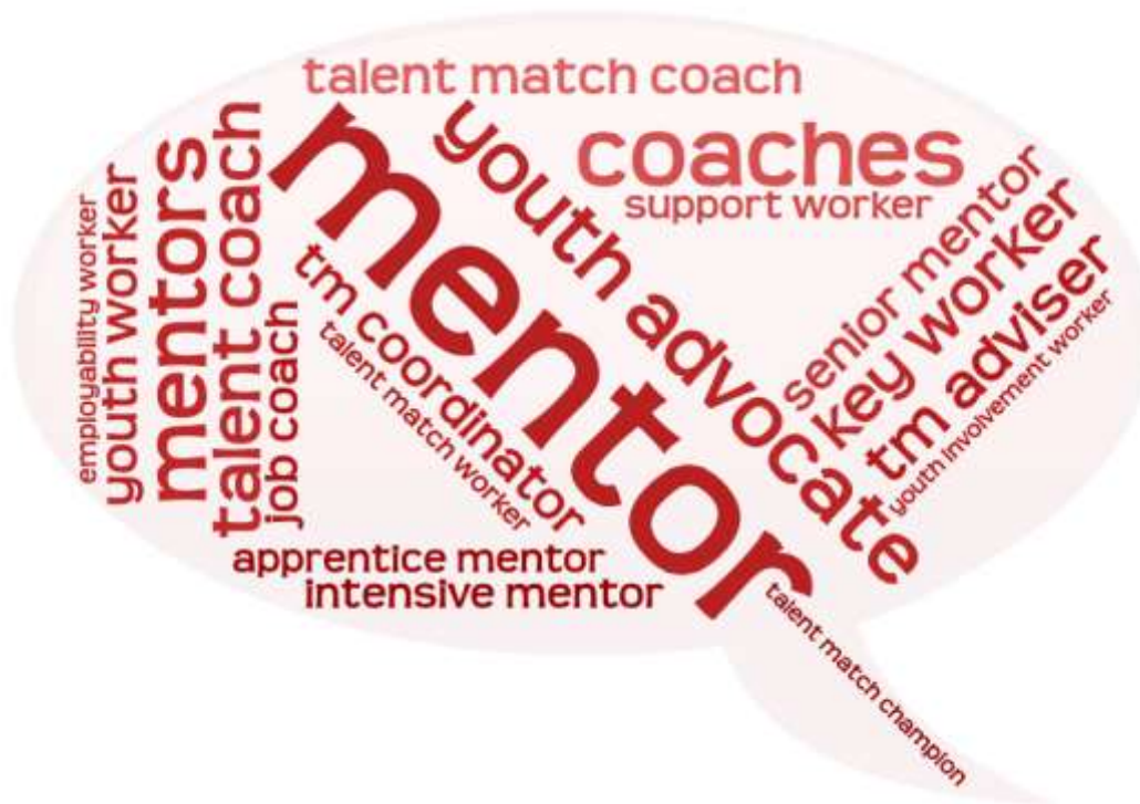
Figure 1: Terms used to describe key worker

A range of terms are used by TM partnerships to describe a key worker (see Figure 1), with mentor and advocate being the most frequently used terms.