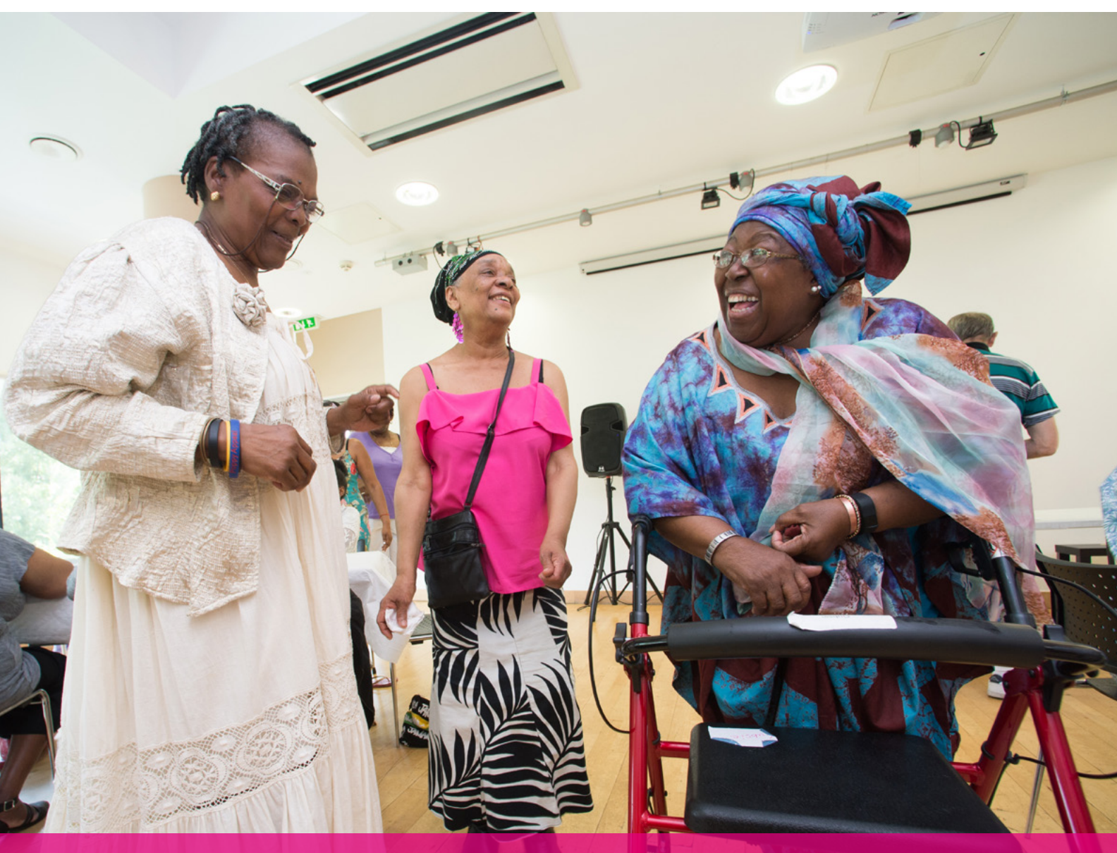
Big Lunch - Connect, Hackney

Initial indicators from established Community Connector projects suggest sustainability can be achieved. In Birmingham and Leicester, there is already some indication that the ABCD approach empowering volunteers to design and deliver their own activities, are likely to continue after funding has ended. However these approaches will require funding to maintain delivery. Many partnerships work closely with statutory providers and are aligned with health and social care developments. Partnerships are hopeful that this may lead to further funding.