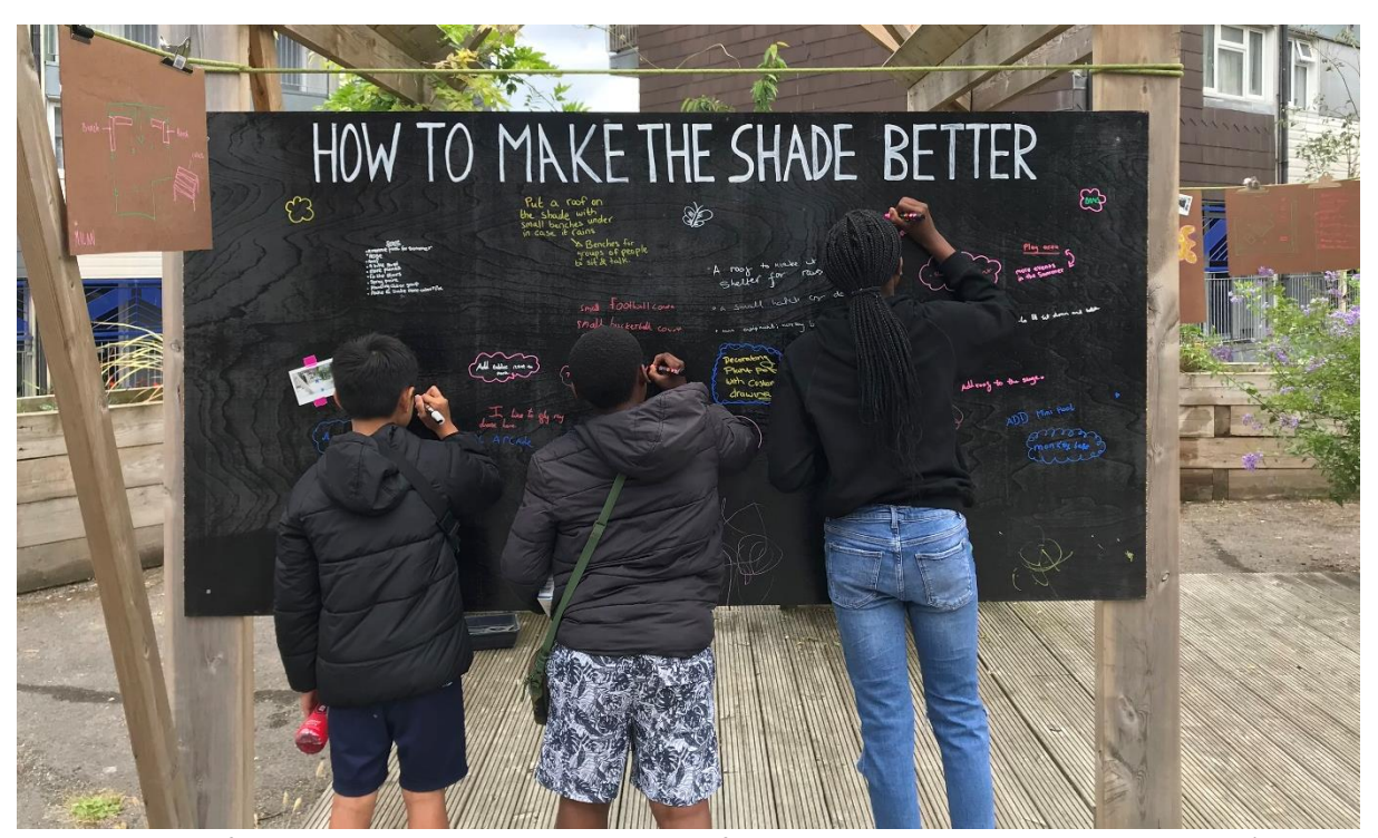
Photo: A group of young people writing their suggestions for how to improve their community space (Build Up London)

As previously highlighted, some projects also supported participants to share their experiences with others who may be experiencing something similar e.g., through a podcast or book. This, staff suggested, helped participants to 'own their narrative' and provide support that would be relevant and applicable to others going through a similar experience.