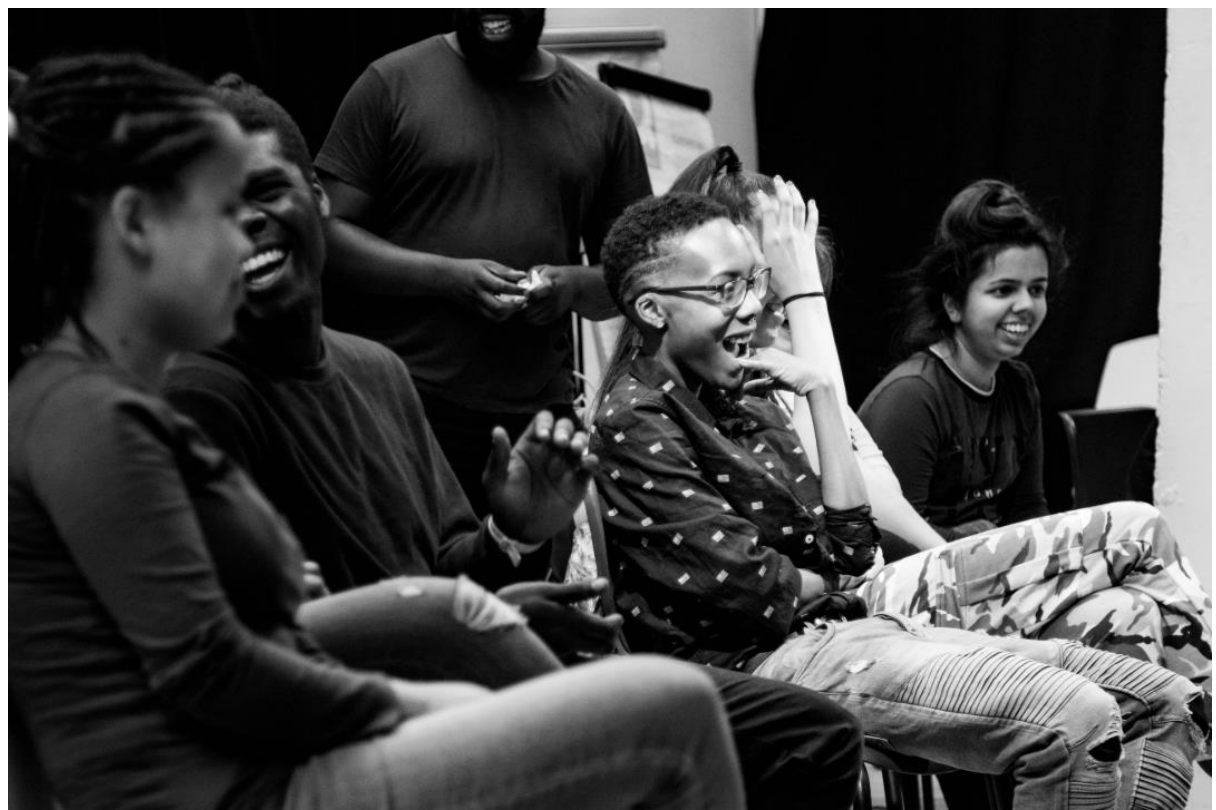
Photo: A group of people sitting together enjoying a performance as part of Citz Young Storytellers

BIGKID Foundation 's Boys' Football Programme supported young people to participate in projects based around community cohesion using football as an engagement tool. This included delivering a football programme running two sessions a week. Online sessions were also delivering throughout the Covid-19 pandemic which included creative workshops and topical discussions around mental health and social justice, as well as virtual football-related content (such as football challenges, interviews and fitness sessions).