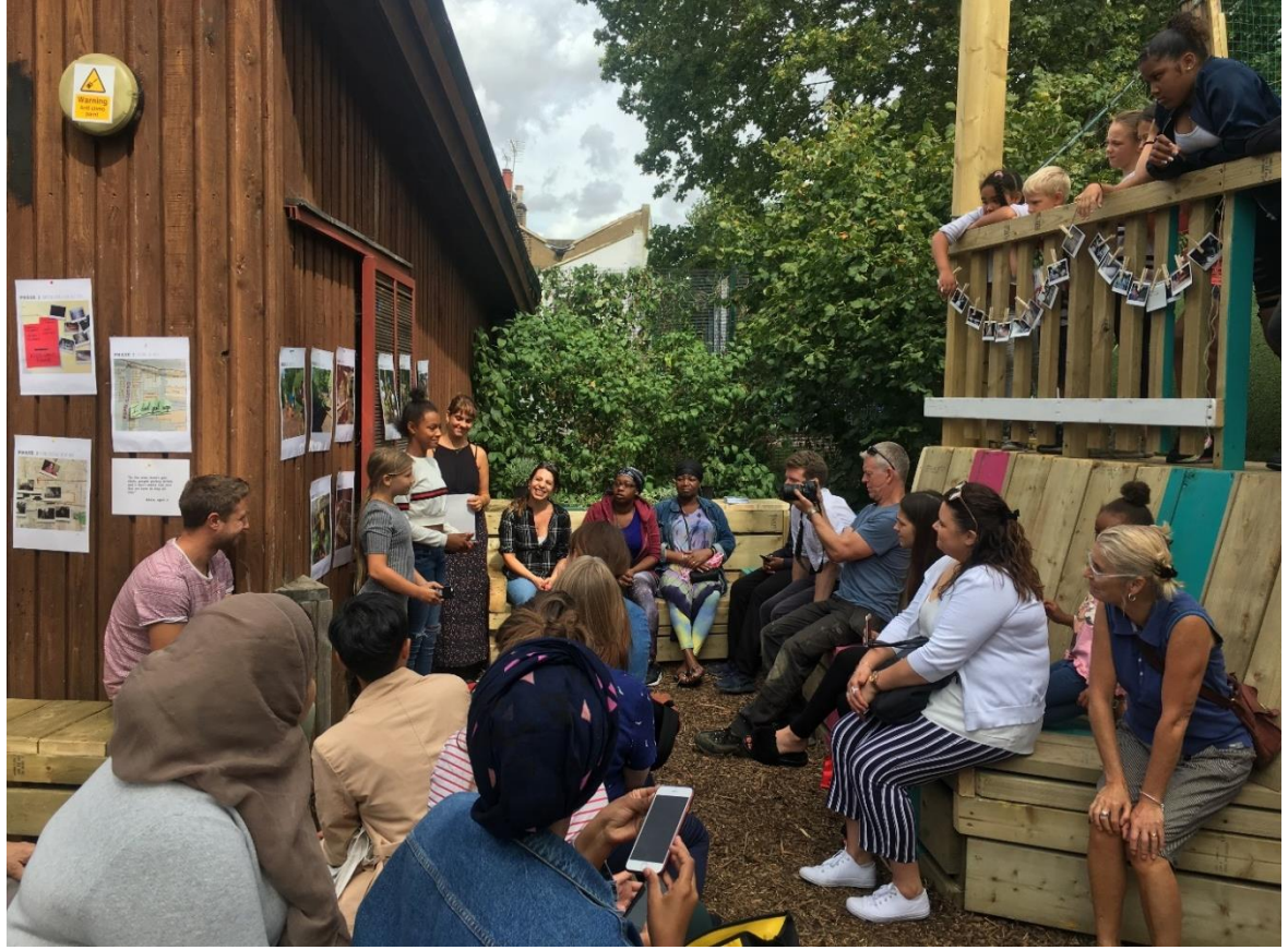
Photo: A group of people sitting on one of the structures created by young people as part of Build Up London

Interviewed staff from another project reported that partnership working has helped them to involve other young people beyond those that engage with their own services. This partnership enabled them to reach a wider audience of young people interested in making a difference and offer social action opportunities.