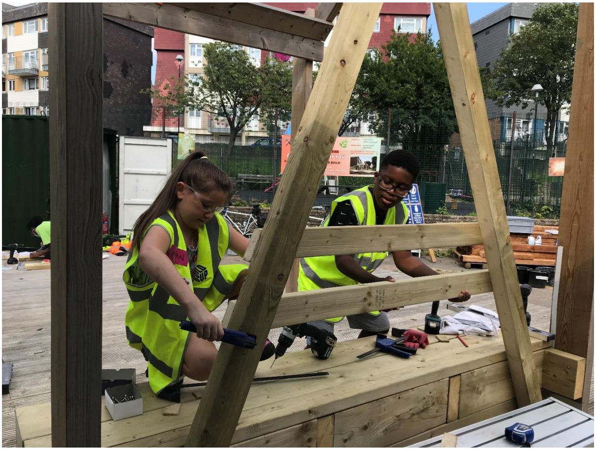
Photo: Two participants building a wooden structure with tools in Build Up London project