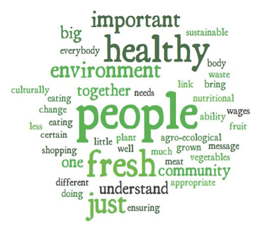
Figure 1: Good food word cloud<sup>7</sup>

The findings overall illustrate the diversity of interpretations of what constitutes good food . The concept is concerned with people and community, the quality of the food (e.g., fresh, healthy, culturally appropriate), the protection of the environment, and justice (e.g., just wages). A Word Cloud based on interviewees' responses (see Figure 1) highlights some key aspects associated with the concept and shared by the interviewees.