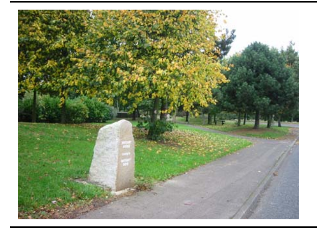
Figure 3 Figure 4

6. In addition to the Lisvannon Garden some funds were also earmarked for improvements to other green areas on the estate along with improved signage (Figure 3). One throughway was effectively a no go area due to drinking and riding of motorbikes, but improved lighting and a gate designed by a local artist has made this path save and it is again being used frequently by local residents (Figure 4).