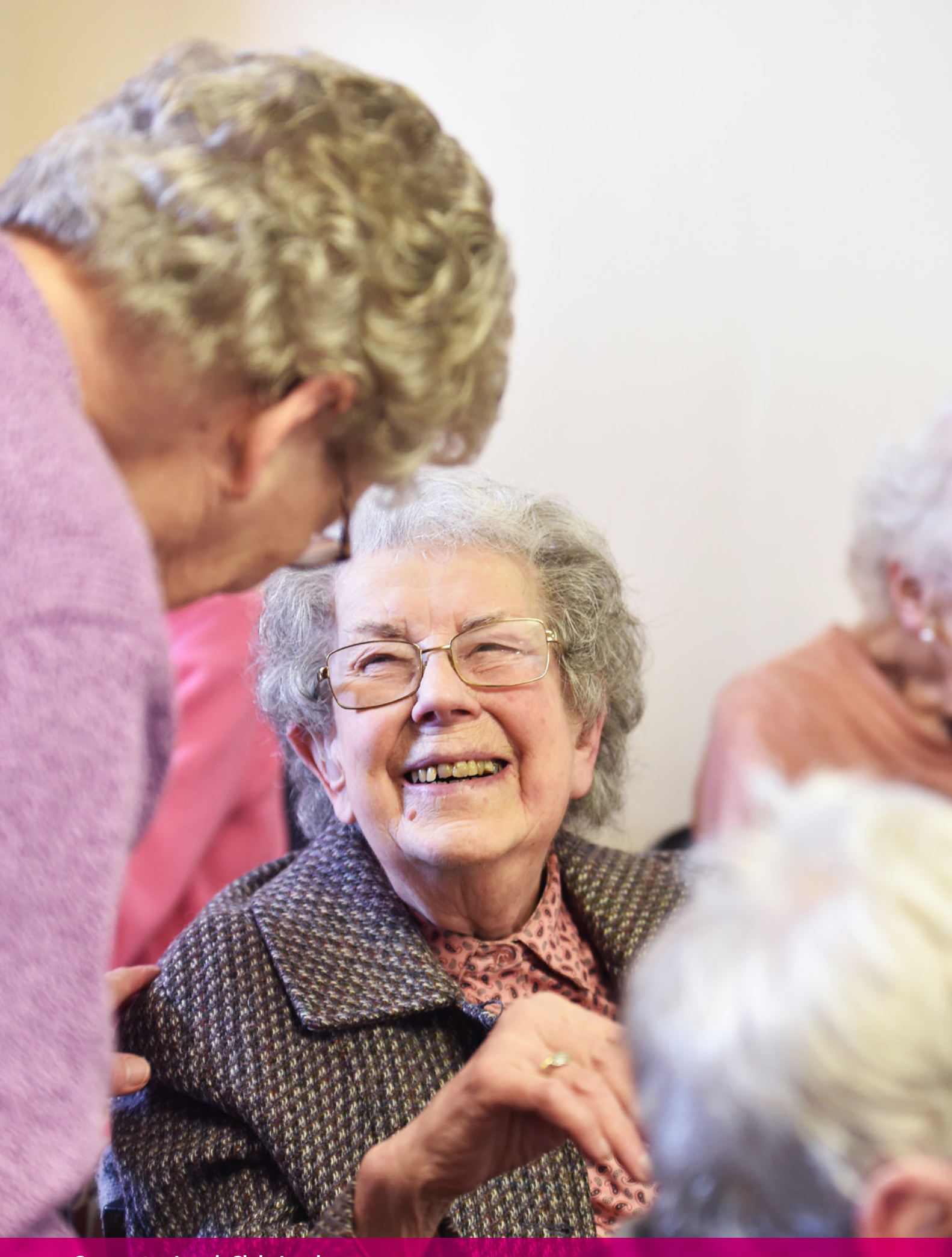
Crossgates Lunch Club, Leeds