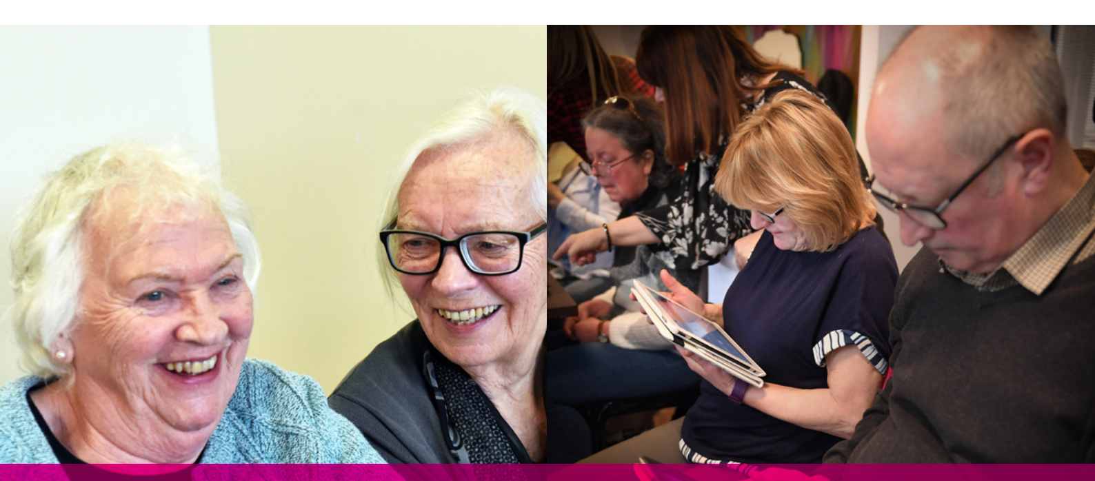
Crossgates Lunch Club, Leeds

Ageing Better is a National Lottery funded programme set up by the Big Lottery Fund, the largest funder of community activity in the UK. It aims to develop creative ways for older people to be actively involved in their local communities, helping to combat social isolation and loneliness . The programme is running from 2015–2021 and is delivered by 14 cross sector partnerships across the UK.