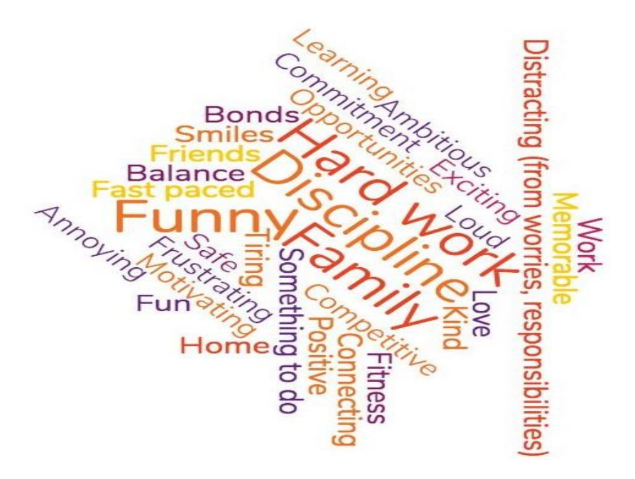
Figure 1: Words young people used to describe their experience of attending

Associations on various housing estates, and working closely with the local police force and local youth service providers. This not only enables effective signposting and referrals of young people to/from these partner organisations, but also offers them the ability to access some of the limited green and open spaces and local venues they can use to offer sports activities for young people.