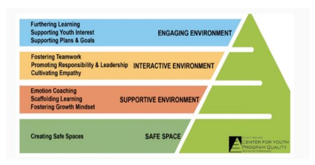
Figure 2: YPQU Pyramid of programme quality