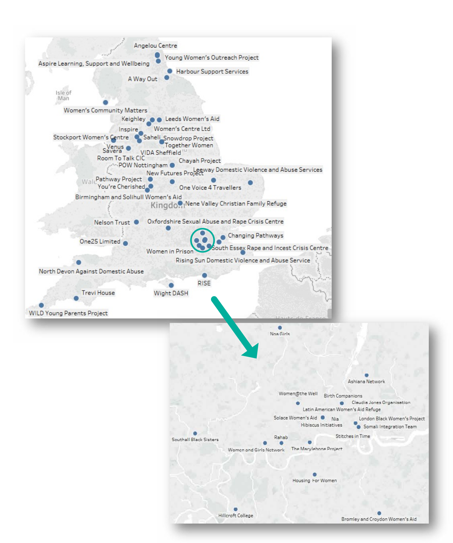
Figure 3: The geographic spread of projects across England