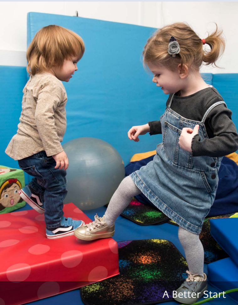
A Better Start

But it's reported that people with lived experience are still viewed by much of the social sector as, "informants, rather than change-makers and leaders of change." 16 This means that organisations are working at the lower levels of user involvement, along the lines of, 'you said – we did', rather than working together in genuine partnership to better understand and implement their ideas and suggestions.