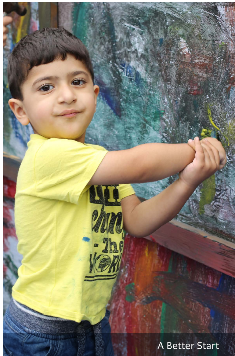
A Better Start

Parent champion from the Lambeth Early Action Partnership (A Better Start)