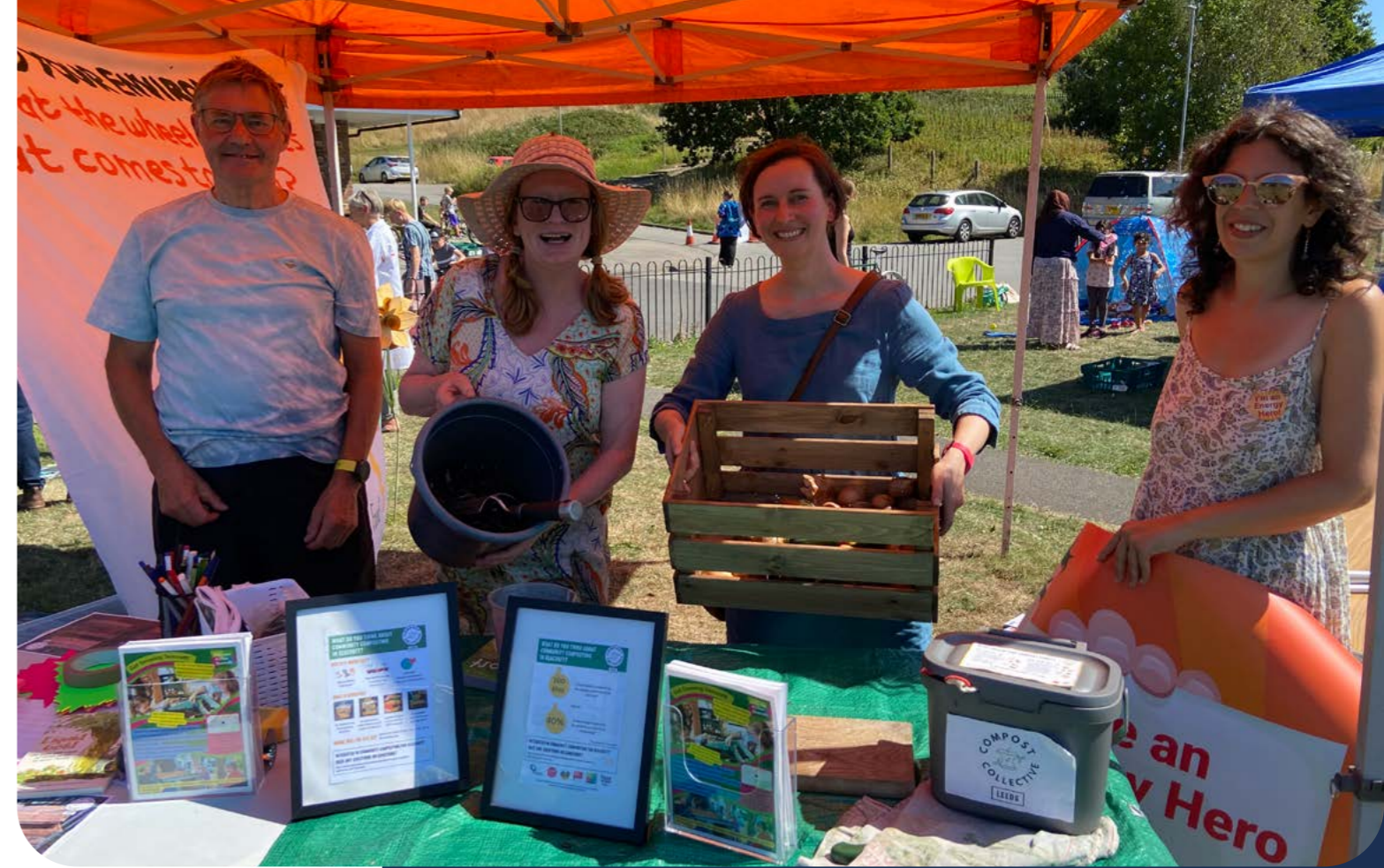
Figure 6 - Composting stall, Seacroft Community Hub, Climate Action Leeds