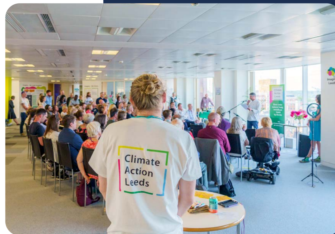
Figure 2 - The launch of Imagine Leeds: climate action hub, Climate Action Leeds