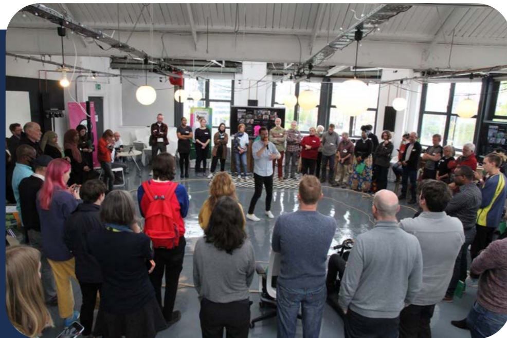
Figure 7 - Launch of the Leeds Doughnut, Climate Action Leeds