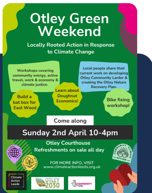
Figure 4 - Climate Assembly poster

issues. It is the space where CAL/programme leads can hear from and connect with every aspect of the programme, where synergies can develop and partner teams can work together and learn from each other.