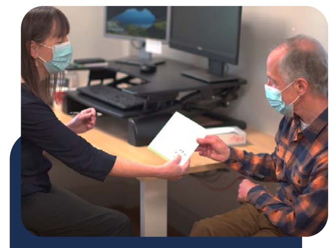
Figure 2 - A Green & Healthy Future for Frome, 'Choosing Wisely' project.

Finally, Storytelling builds community engagement and wider knowledgesharing about the overall programme and its events through multiple media.