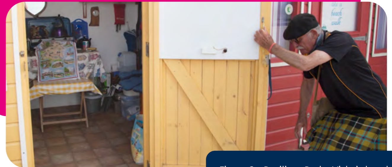
Figure 3 - Resilient Bude, Vicko’s beach hut from ‘Vicko’s Story’