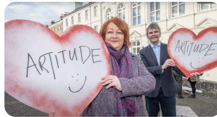
Figure 4 – Artitude, Climate, Culture,

Artitude: Climate, Culture, Circularity is a partnership involving The Derry Playhouse, Zero Waste Northwest, Northern Ireland Resources Network, Queens University Belfast and Derry/Londonderry City and Strabane District Council. The Partnership co-ordinates and delivers a programme of creative activities grounded in the circular economy, using the arts and creative practice to encourage behaviour change and challenge attitudes to waste, consumption, and climate action.