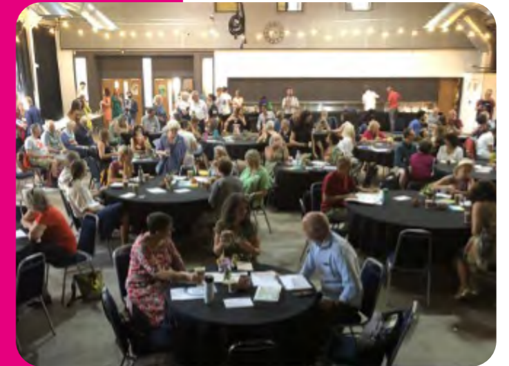
Figure 2 - Green and Healthy Future for Frome, Health & Climate Conference, July 2022

In July 2022, Green and Healthy Future for Frome organised a conference which attracted 150 people from 40+ community, charity, public and private sector organisations, including healthcare professionals and energy sector specialists. The purpose of the event was to share their learning experiences and tell the story behind the unique partnership of the programme. When planning and inviting speakers, they thought of ways to showcase a wider context of climate change by working to create a diverse and inclusive event that involved people of colour and younger voices who spoke on climate-related issues such as politics, inequality, and justice. This encouraged people to think about the bigger picture and connect it to new ways of taking action in their communities and organisations. The event sold out and amplified the global context of Green and Healthy Future for Frome and recognised that climate change isn't a future problem – it's reality for many communities around the world.