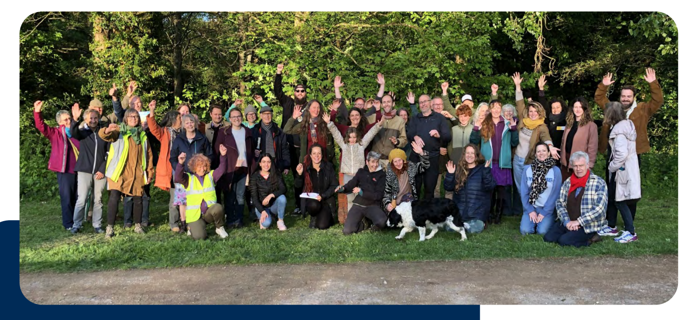
Figure 1 - Frome Climate Action Group 2022

CAF's vision is to empower and inspire people in local communities to take positive action on the climate emergency, thus demonstrating what's possible when people take the lead in tackling climate change.