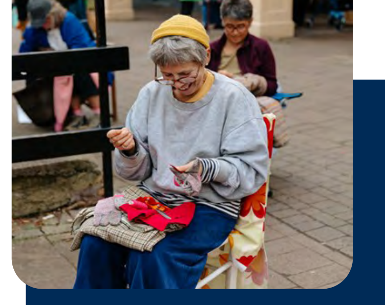
Figure 8 - Stitching during Sustainable Fashion Week

There are currently (November 2023) four groups in residence with Future Shed: Frome Food Network, Everyone Needs Pockets (ENP) Textile Reuse Network, Frome Families for the Future (FFFF) and the Frome Seed Library.