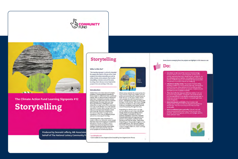
Figure 4 - Climate Action Fund Learning Signpost #12: Storytelling

Storytelling is led by a dedicated Green and Healthy Communications Lead at Edventure who collaborates with communications staff at other Green and Healthy Frome partner organisations to plan, share ideas and coordinate content across the programme. For further details please see the Climate Action Fund Learning Signpost #12: Storytelling.