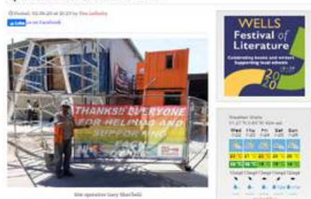
Building contractor gives Orchard Vale Trust in Wookey thumbs up for National Volunteers Week

This has meant that the jobs Stile Gardening takes on can focus on those most in need in our community. Elderly people, single mothers, people living with disabilities, are all amongst our gardening clients and as a result, the service we provide has impacted on many levels.