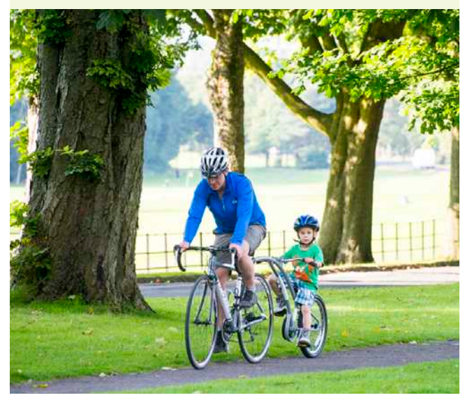
Towneley Park, Burnley

The World Health Organization defines health as 'a state of complete physical, mental, and social wellbeing and not merely the absence of disease or infirmity'. Mental health is defined as a state of wellbeing in which 'every individual realises his or her own potential, can cope with the normal stresses of life, can work productively and fruitfully, and is able to make a contribution to her or his community'. In this review we use 'health' to encompass physical health benefits and 'wellbeing' to refer to mental health, recognising the interconnectedness of the two concepts.