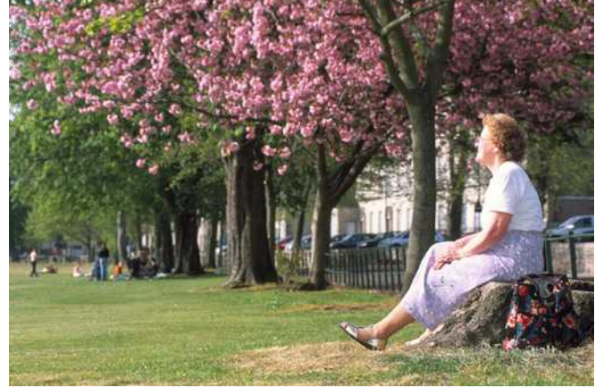
Pittencrieff Park, Dunfermline