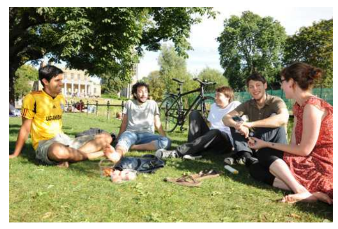
Clissold Park, London