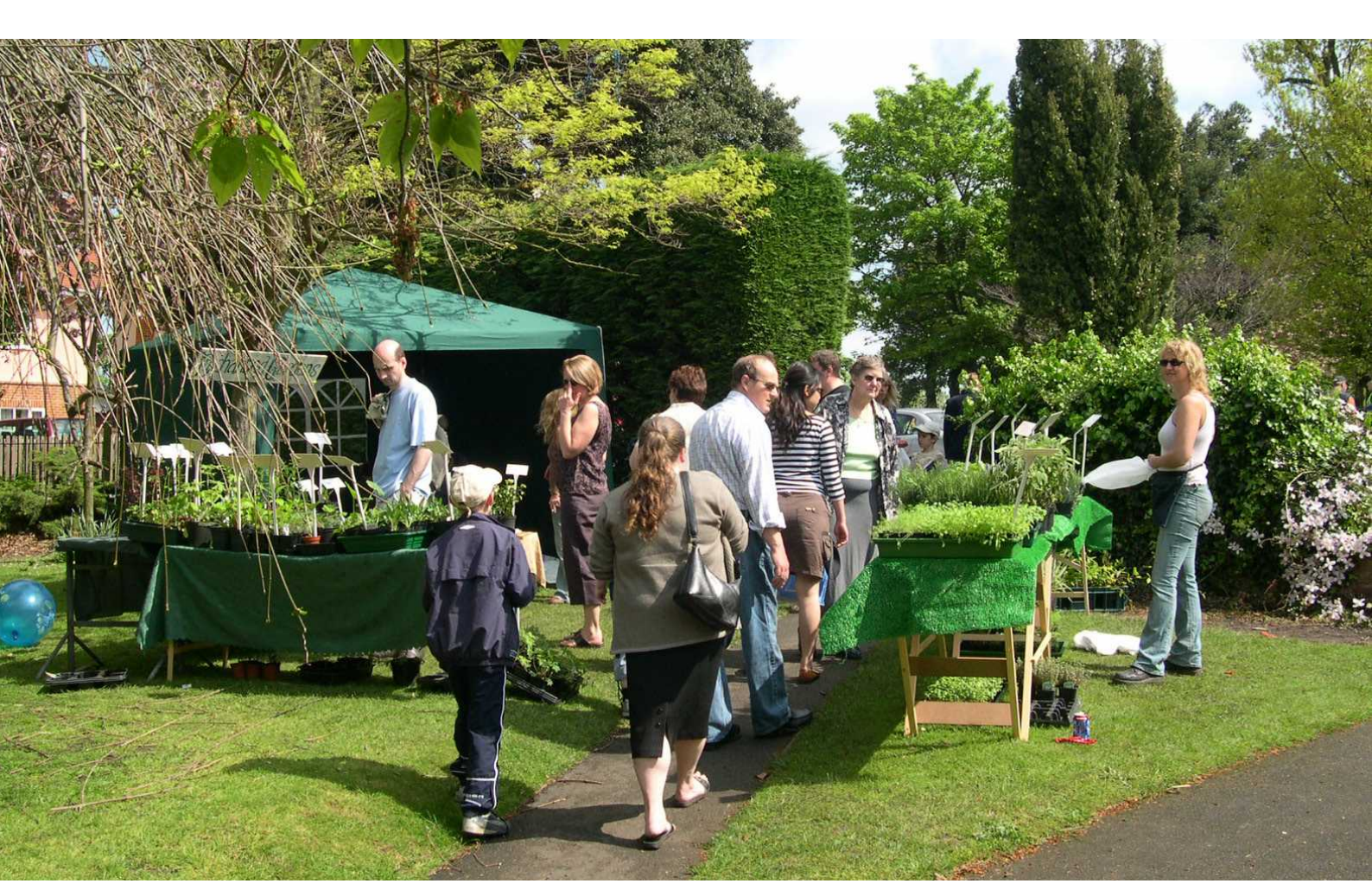
Whitstable Castle Park, Whitstable

The evidence is presented within a context of increasing policy interest in the social benefits of parks and green spaces. Following work by The National Lottery Heritage Fund, the National Lottery Community Fund and civil society organisations, there is growing political recognition of the social importance of public parks. This has been recognised in, for example, the Loneliness Strategy announced by the Government in October 2018, and in work by NHS England on creating healthy new towns.