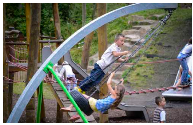
Barnes Park, Sunderland

Playgrounds, unsurprisingly, are linked with increased physical activity among children (McCormack et al., 2010; Jenkins et al., 2014;