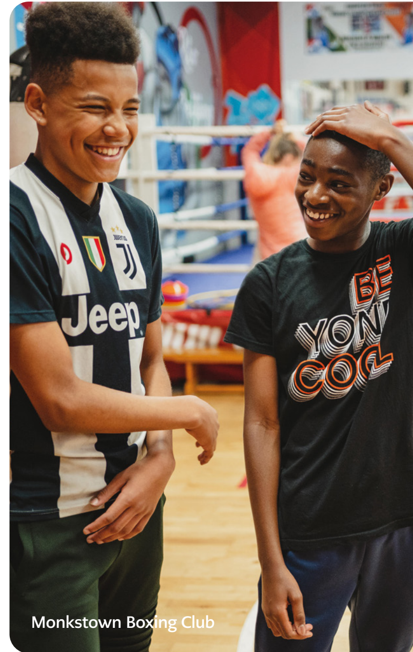
Monkstown Boxing Club

We can also show small grants are the most effective funding platform to mobilise community volunteers and the organisations that support them, and our range of small grant funding over the pandemic only reinforced this.