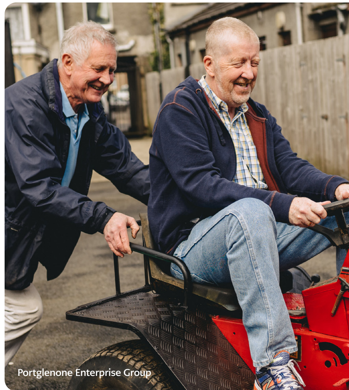
Portglenone Enterprise Group