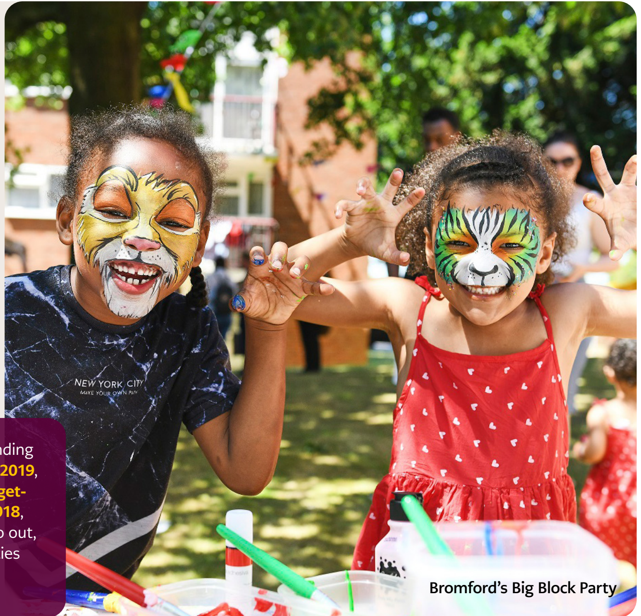
Bromford's Big Block Party

At the event in 2019, 54% of groups had not received our funding before, but this money acted as a catalyst, with 96% planning to arrange additional events and 72% more likely to apply to us for funding in the future.