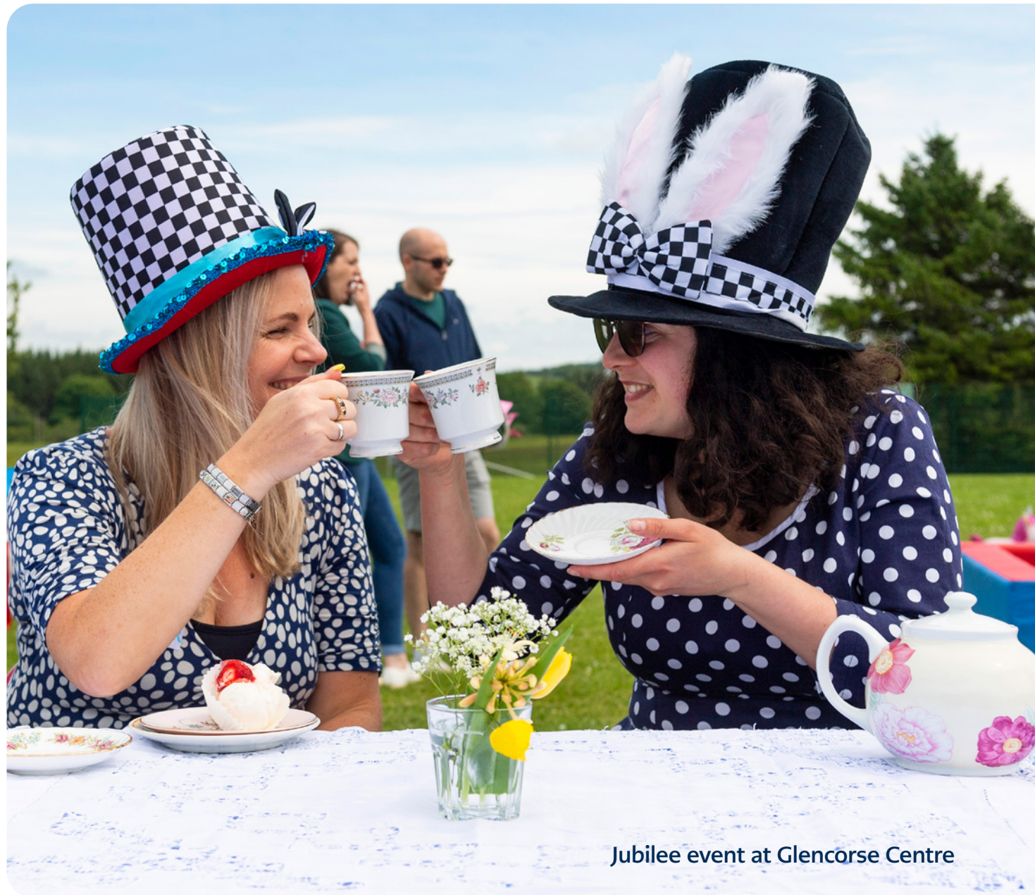
Jubilee event at Glencorse Centre

For some programmes we've developed microgrants – from £250 to £1,000 – to make it even easier for communities to access funding to bring them together.