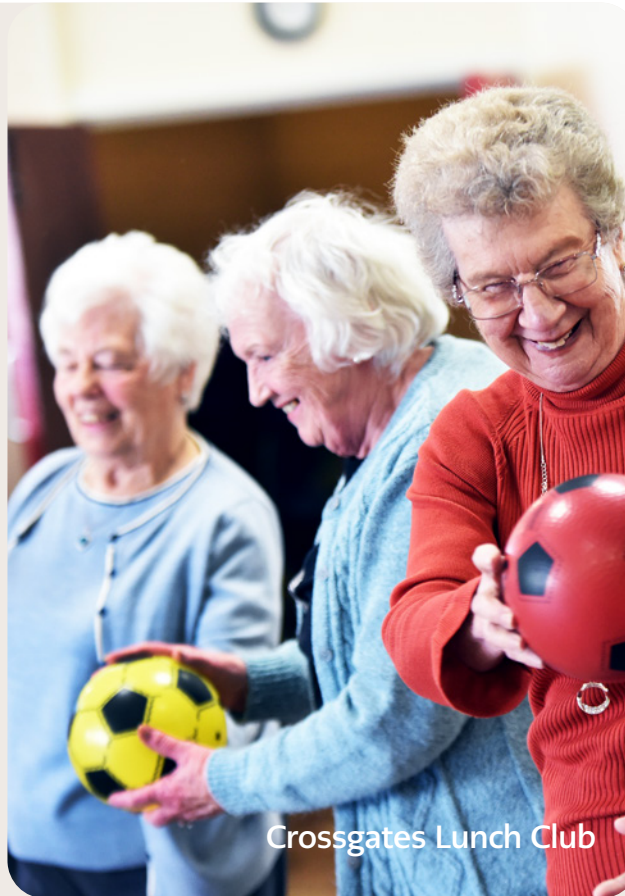
Crossgates Lunch Club

Because community members are more engaged, micro-funded projects can test ideas and inform policy decisions. This approach is reshaping local community services, developing people's confidence and capability to run their own activities, and boosting capacity for meaningful and sustainable change.