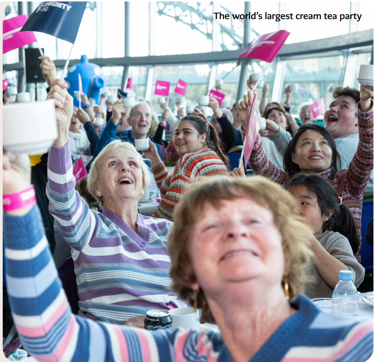
The world's largest cream tea party

We also support one-off events like achieving the Guinness World Records title for largest cream tea party at the Sage Gateshead in October 2019, hosting 1,054 people from all over the world.