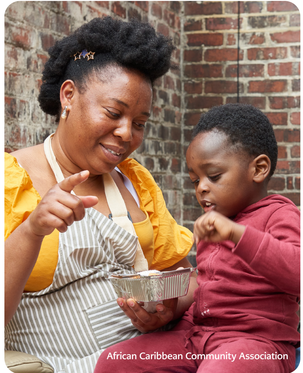
African Caribbean Community Association

We believe that through our small grants we are helping to build something much bigger. Sometimes that is by supporting organisations to grow; sometimes it is by investing in ideas that flourish. It is through small grants to communities and the people that live in them that new social initiatives are born, new groups help transform communities and new local leaders help bring people together.