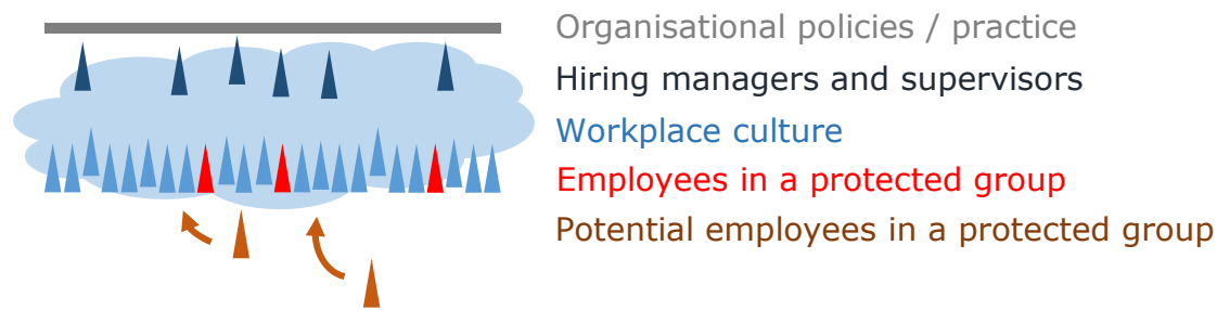
Figure 3: The different intervention points for addressing inequality in organisations

improving an organisation's HR policies. This is summarised in figure 3, which illustrates the different intervention points taken by projects.