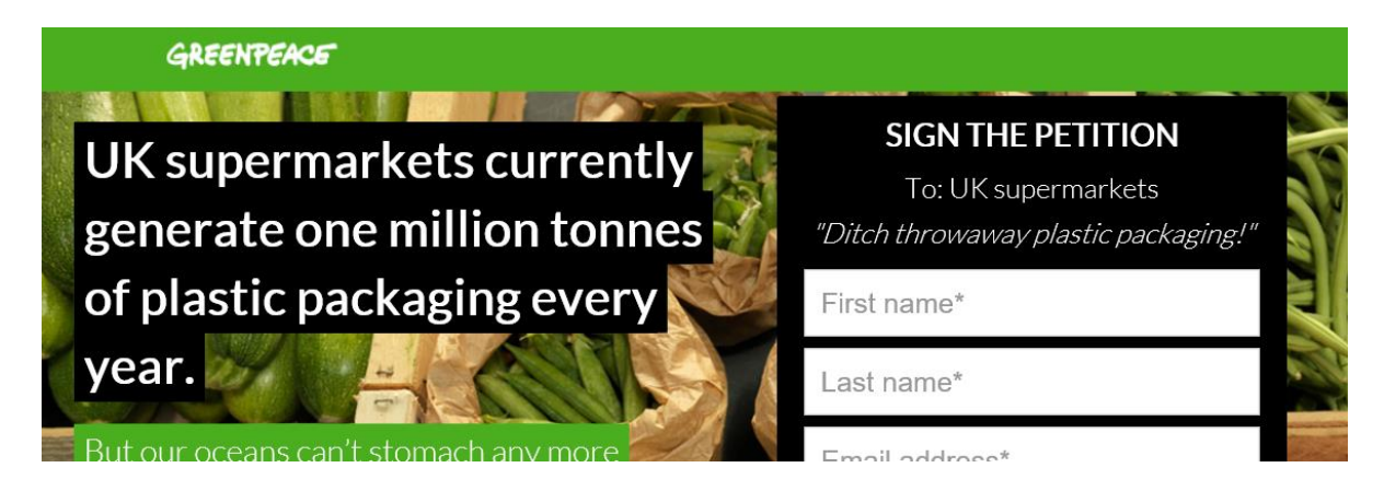
Figure 3: Greenpeace Online Petition<sup>1</sup>

As an example, in the image below, Greenpeace are asking supermarkets to "Ditch throwaway plastic packaging". Part of their campaign is to gather a high volume number of names on their e-petition to demonstrate public appetite for this ask.