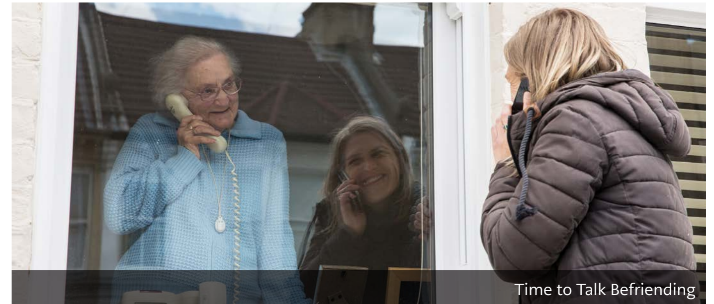
Time to Talk Befriending

We fund projects like the Time to Talk Befriending project who uses National Lottery Awards for All funding to match volunteer befrienders with vulnerable older people who would otherwise have minimal or no other social contact, or our Reaching Communities grant to The Voice That Makes A Difference, based in Northampton, which brings over 1,000 young disabled people together to enjoy films by providing 24 hour accessible screenings at local cinemas.