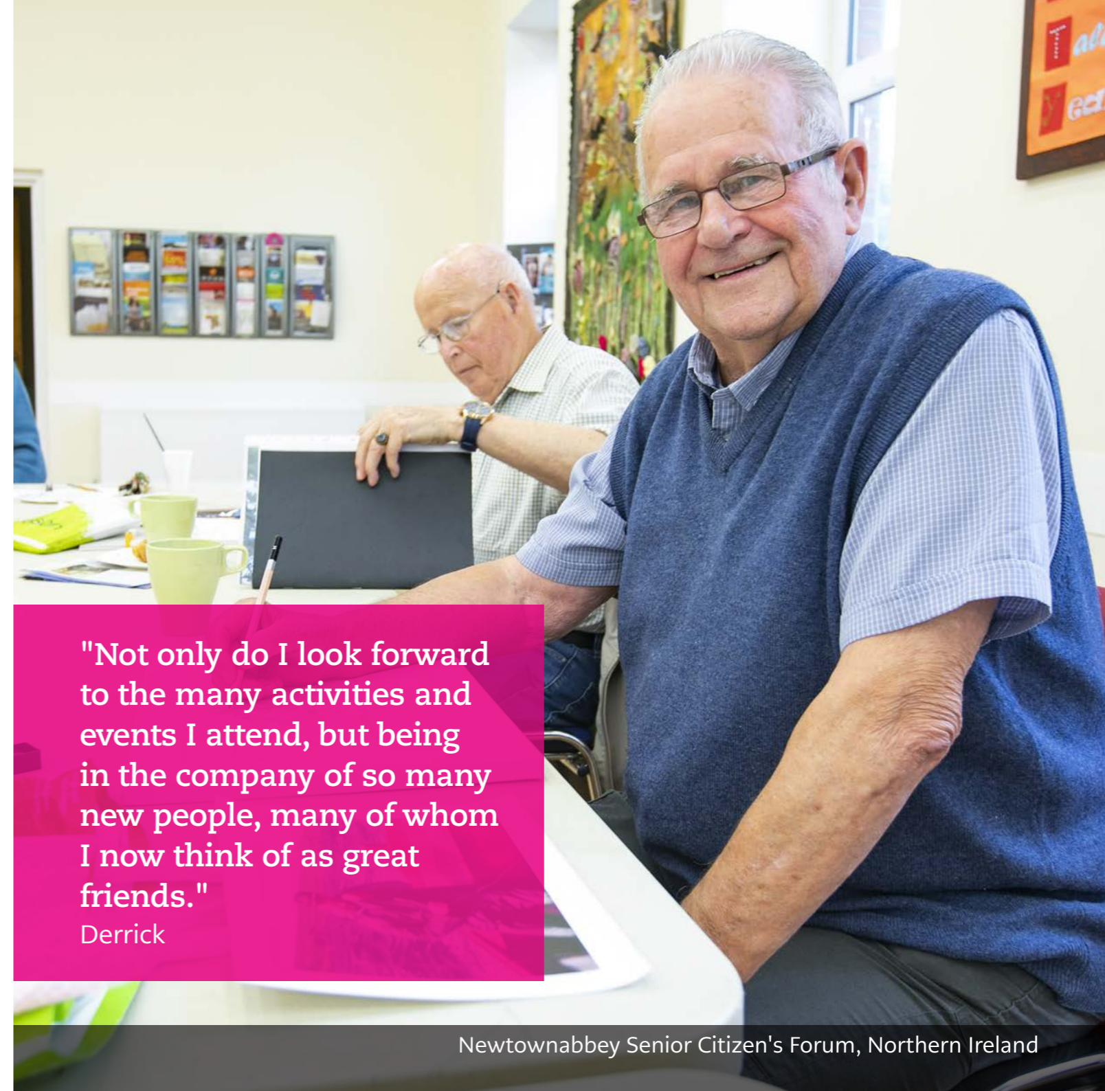
Newtownabbey Senior Citizen's Forum, Northern Ireland