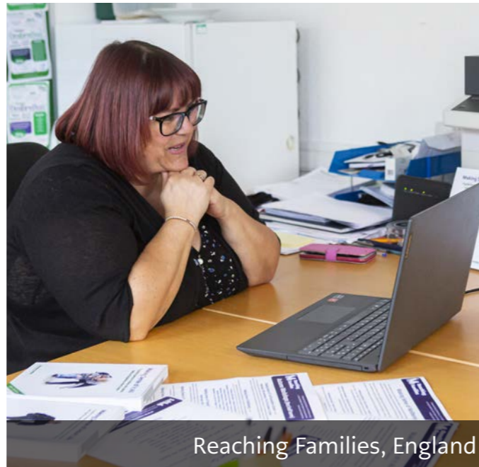
Reaching Families, England

Nearly 10,000 people have used these learning resources since launch in the summer of 2020.