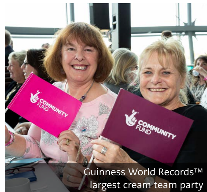
Guinness World Records™ largest cream team party

In November 2019, to celebrate the 25th birthday of The National Lottery, we built on our experience of awarding microgrants with #CelebrateNationalLottery25, making £2 million available for people to apply for funding up to £1,000 to bring people together in their community. 54% of applicants were applying to us for the first time. Grants were awarded in 2020.