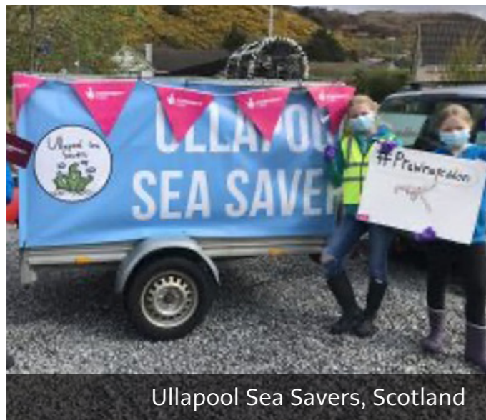
Ullapool Sea Savers, Scotland

Children's marine conservation charity Ullapool Sea Savers held a socially distanced, community-wide, prawn appreciation party to support local fishermen and boost morale during the COVID-19 lockdown.