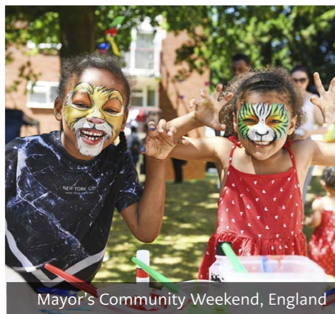
Mayor's Community Weekend, England

52% of successful applicants had never applied to us before.