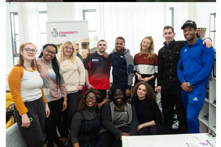
Young People in the Lead Advisory Group