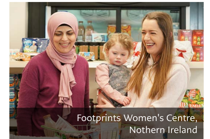
Footprints Women's Centre, Northern Ireland

Last year, 87% of new grants were for £10,000 or less