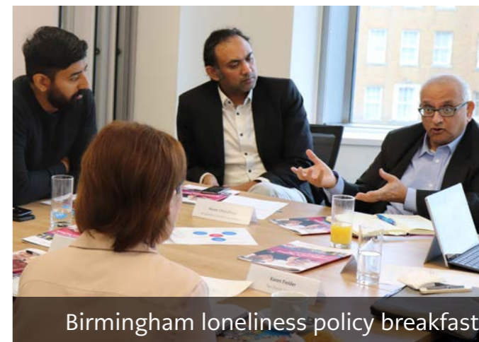
Birmingham loneliness policy breakfast