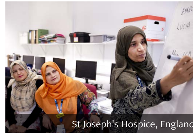
St Joseph's Hospice, England

While the COVID-19 pandemic continues, we are holding similar events online.