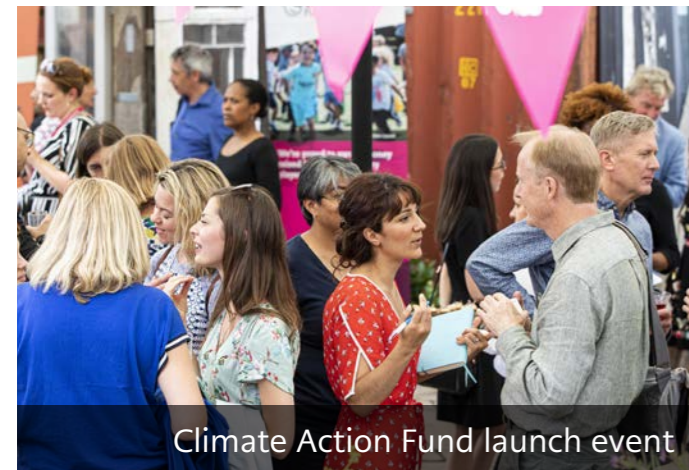
Climate Action Fund launch event

This is part of a three-pronged strategy that alongside our Climate Action Fund, includes ensuring that as an organisation we are as green as possible and supporting community organisations to do the same. For example, by exploring ways to mitigate their impact on the environment. Our Climate Action Top-up scheme is being piloted in Wales and this year we have awarded over £19.5 million from the Climate Action Fund to 23 projects, from Cumbria to Cornwall, and Glasgow to Gwynedd.