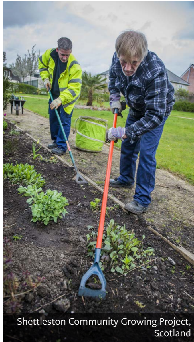
Shettleston Community Growing Project, Scotland

“Not only does this project have a positive impact on the environment in Hackney, it also helps reduce social isolation and enables people to thrive.”