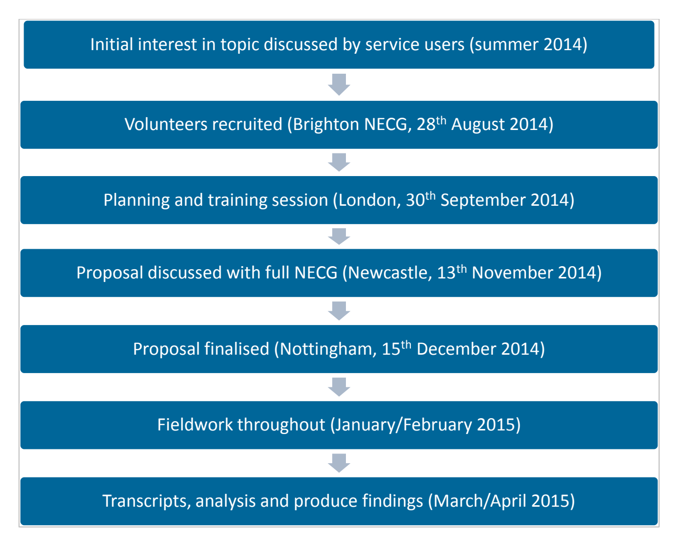
Figure 1 – Timeline for first national peer-led research project

The peer research group developed the methodology through an initial planning session, supported by CFE Research, where the strengths and weaknesses of different approaches were discussed. Initially, the proposal was to conduct semi-structured interviews with project staff and run a focus group with service users for those who were involved in the recruitment process. However, having piloted this approach with the full NECG it was evident that this was not the most appropriate method to adopt. The number of service users with direct involvement in the recruitment process was not enough to warrant a focus group approach. Generally, there were only a few service users with direct involvement at each project and their views could best be elicited through depth interviews. Bringing together such individuals from different projects could be inconvenient and costly. Also, the peer researchers were more confident with conducting interviews as oppose to facilitating a focus group so could better exert their influence on the research through this method.