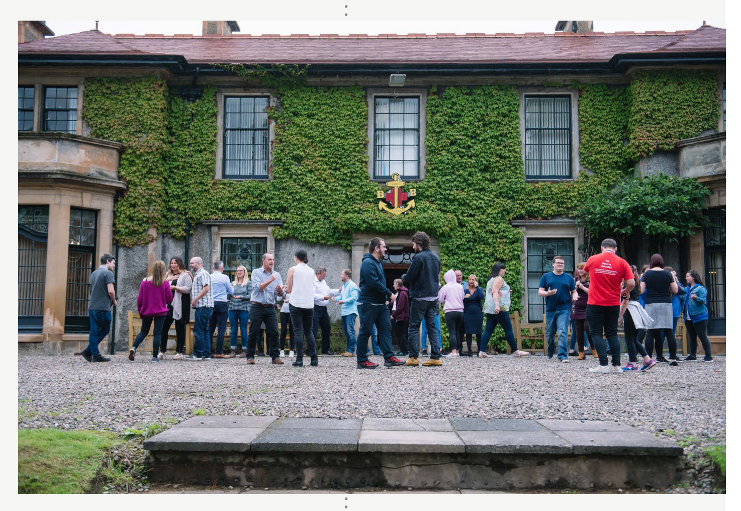
1 Corporate Parents are organisations and individuals who are responsible for protecting looked after children and young people's interests. For more information please see CELCIS' <u>Inform Briefing on Corporate Parenting</u> (2017).

Champions Boards continue to be a fundamental part of the Life Changes Trust's approach to creating transformational and sustainable change. In 2016, the Life Changes Trust invested over £2 million of funding for the first wave of Champions Boards. In 2017, the second wave was launched, bringing the total investment to over £4.4 million.