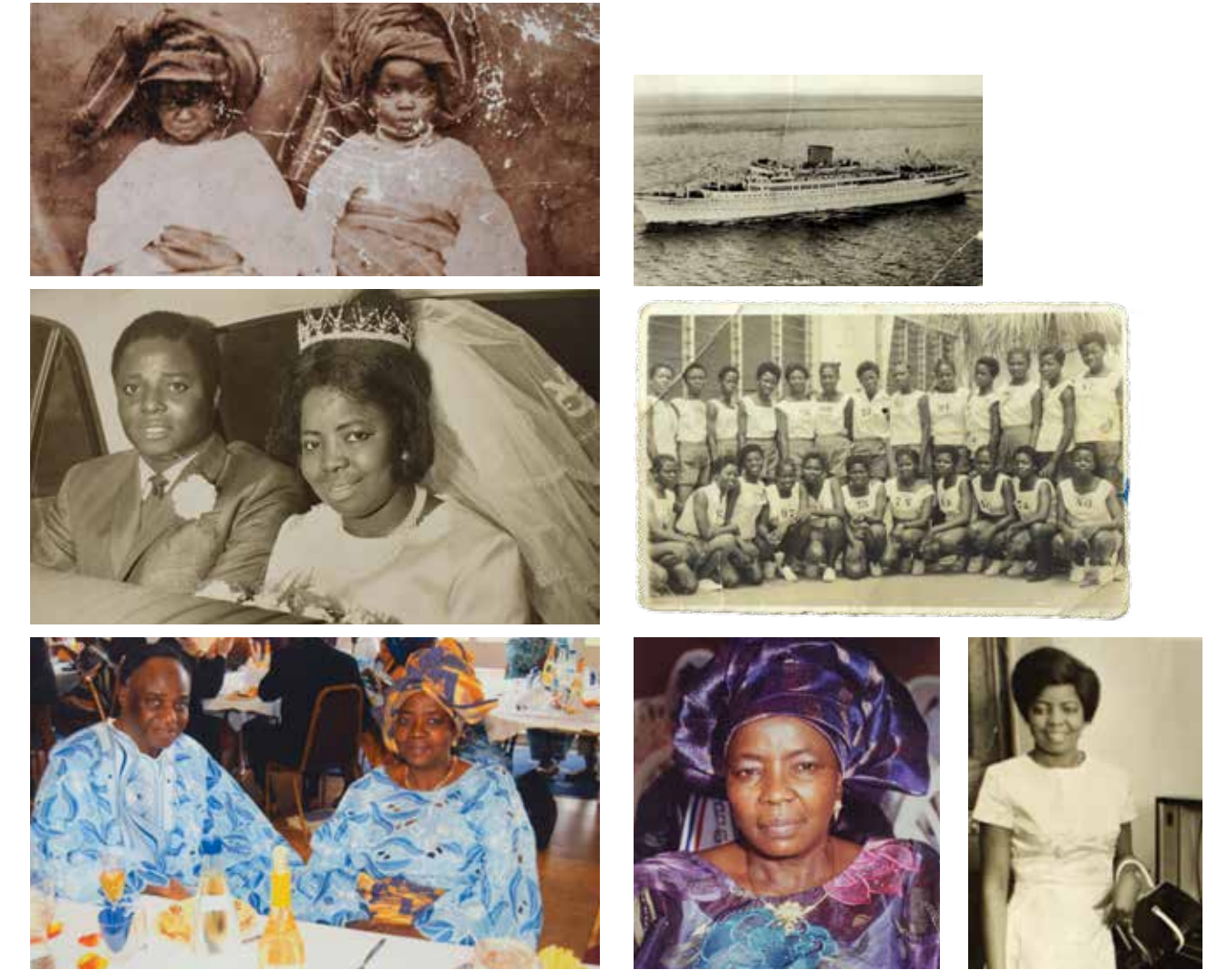
Diversity - Stories of a Hackney Generation • 15

Faith has played an important part in all the communities in Hackney. There are many African-led churches. My Christian faith has played an important part in my journey moving from Africa to Great Britain. The intention was to finish studies and go back home but God had another agenda for me. And I am thankful and grateful for His grace.