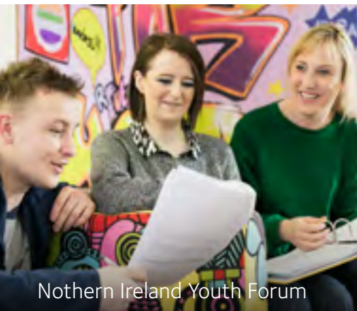
Nothern Ireland Youth Forum

We will make sure that our people feel that Big Lottery Fund is a great place to work where they can develop their careers and will be recognised for their achievements.