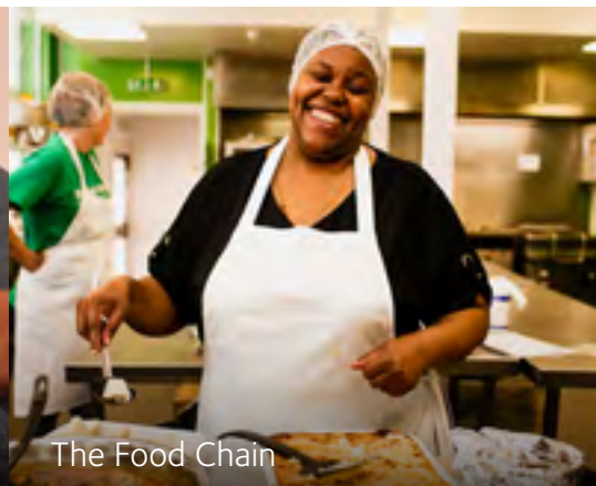
The Food Chain