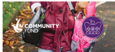
Use on a busy background