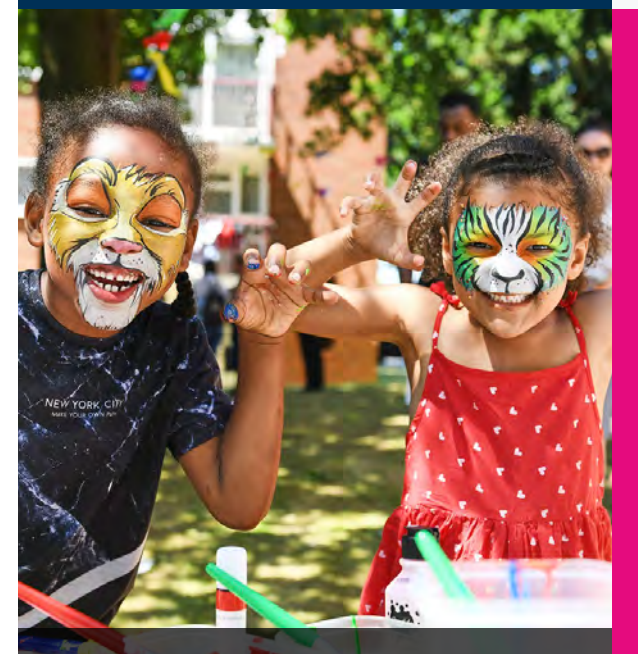
Mayor's Community Weekend