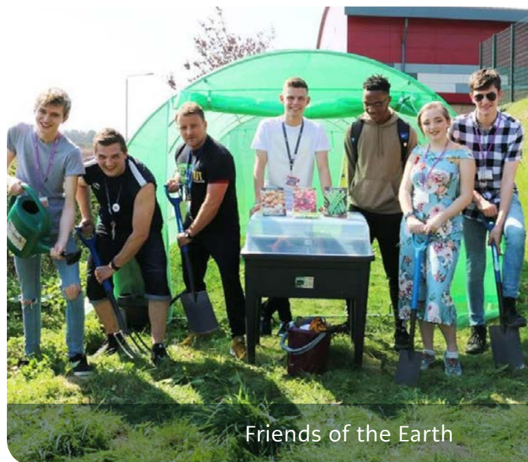
Friends of the Earth

In light of this, we're looking into what we've funded in this area before and during the pandemic, and the difference this has made. We draw on the 4,200 grants that we've given out to charities and community groups over the past five years to support volunteering, amounting to £690 million of National Lottery, government and third party funding. 8 We do this to shine a light on the contribution of the voluntary and community sector (VCS) and the volunteers they work with.