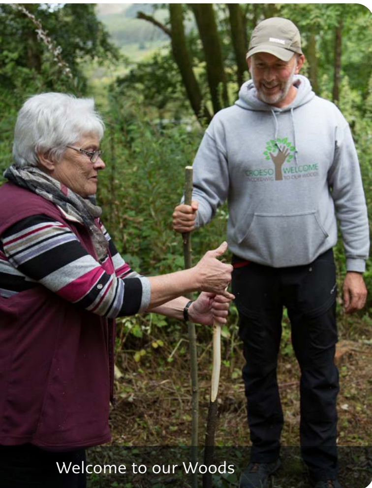
Welcome to our Woods

This report focuses primarily on formal volunteering and volunteering as social action, and less on informal volunteering which is done outside of an organisation – although this will be included where our grantholders recognise it as volunteering. While we may draw from programmes which sometimes pay or compensate people with lived experience for their time, we focus on examples of voluntary support.