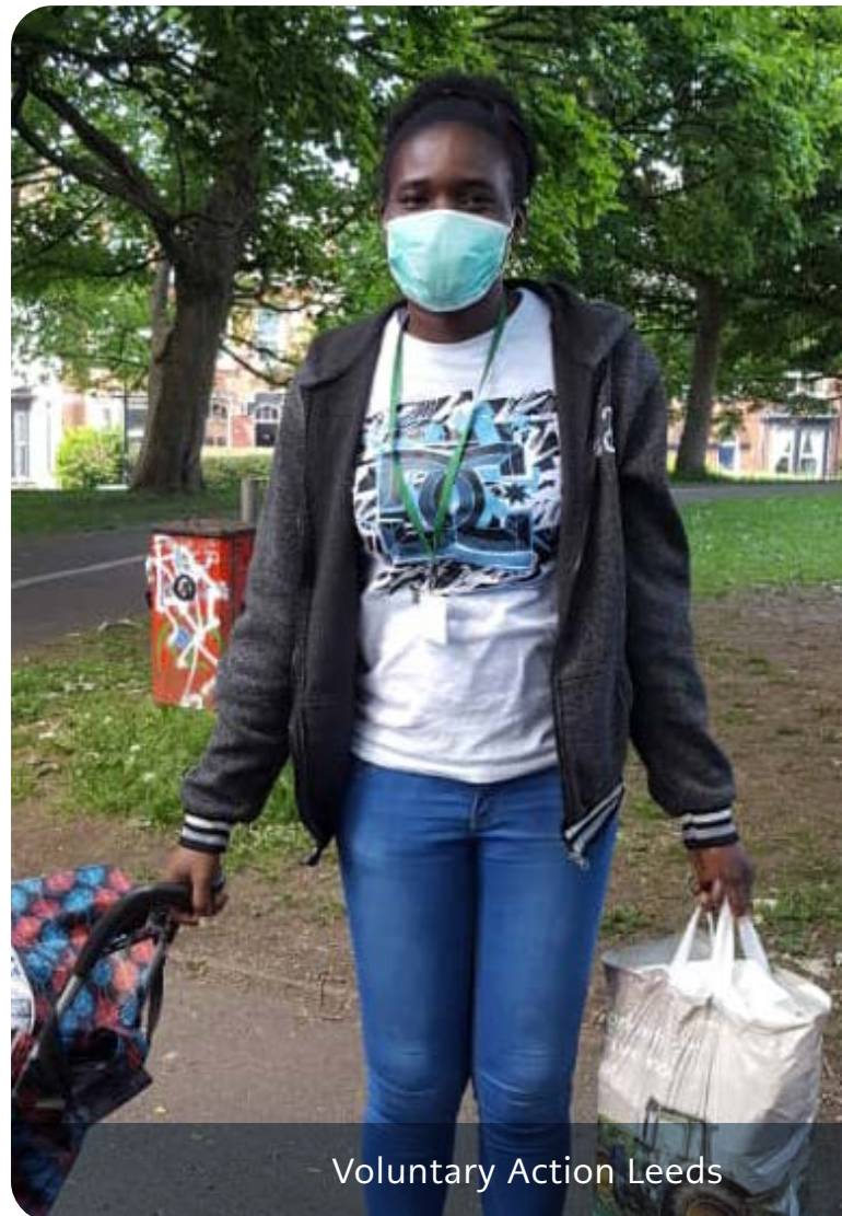
– Voluntary Action Leeds

So VAL looked across the sector, feeding volunteers out to the 1,500 Leeds organisations who were responding to Covid, and supporting groups to make the most of those who wanted to help. As many lacked the capacity and experience to manage larger pools of volunteers, VAL helped with background checks, such as verifying driving licenses, and taking people through the vetting process. They broke down lists of volunteers, ward by ward, and linked them with local organisations. They also provided a dedicated member of staff, with “guidance, support, and a pack – induction materials, checklists, everything they needed to work with the volunteers.” Support was particularly important for smaller organisations, which needed help to build up their internal infrastructure and confidence. 25