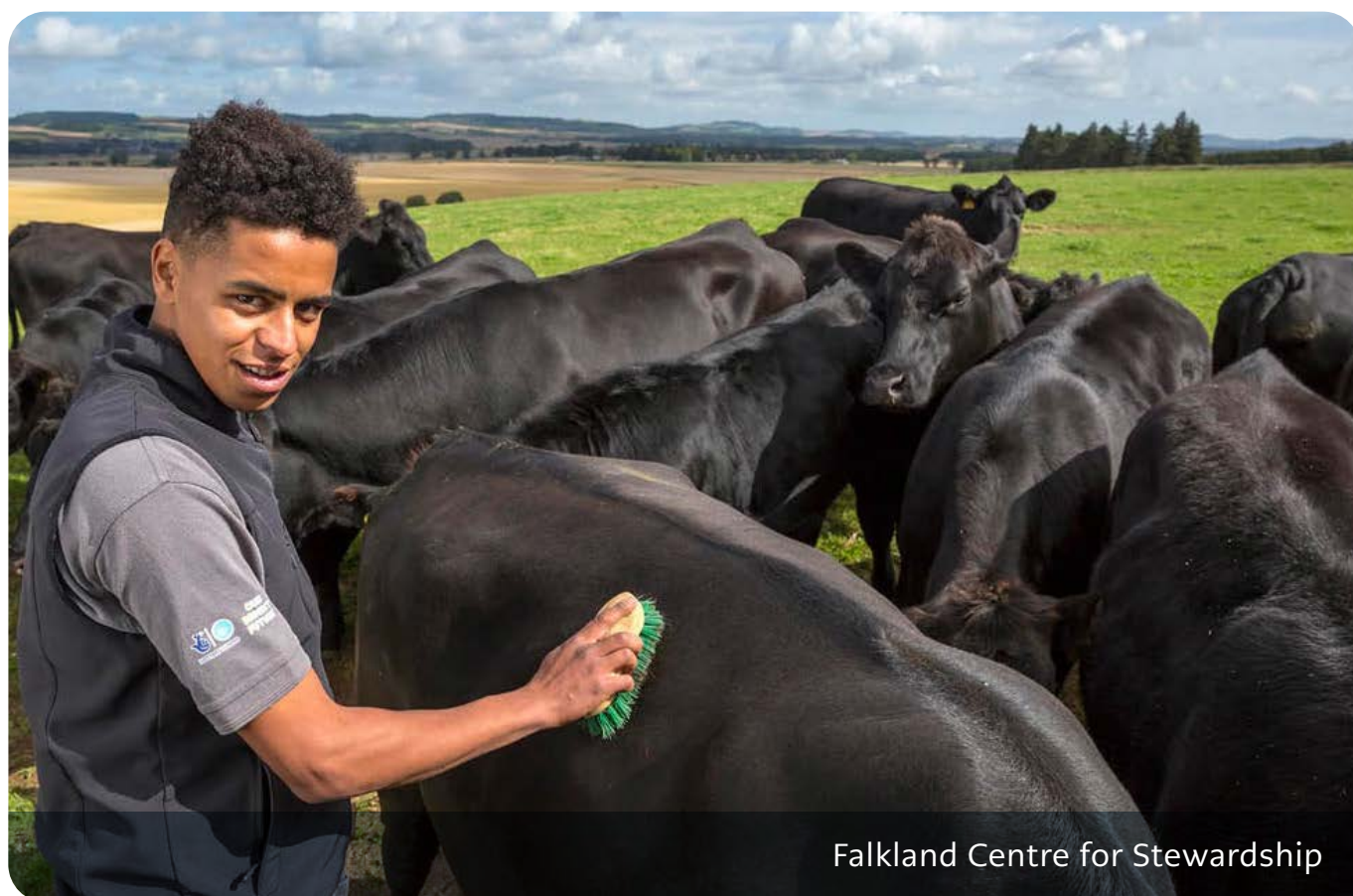
Falkland Centre for Stewardship

Other programmes focus on volunteering as a vehicle for change, including 10 Place Based Social Action partnerships across England that are bringing together local communities with grassroots groups, public sector organisations, service providers and businesses to address priorities in their neighbourhoods. So far 1,320 volunteers are working towards local improvements; from improving local transport, to creating whole new visions for their area, like a dementia friendly borough in Colchester. 15