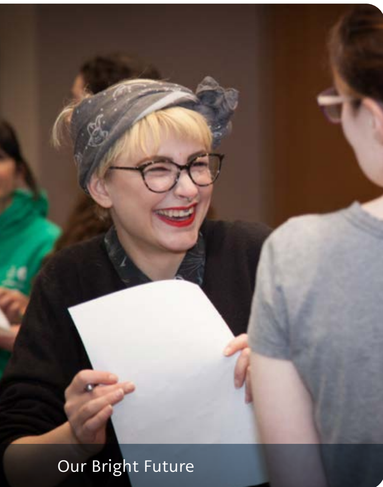
Our Bright Future