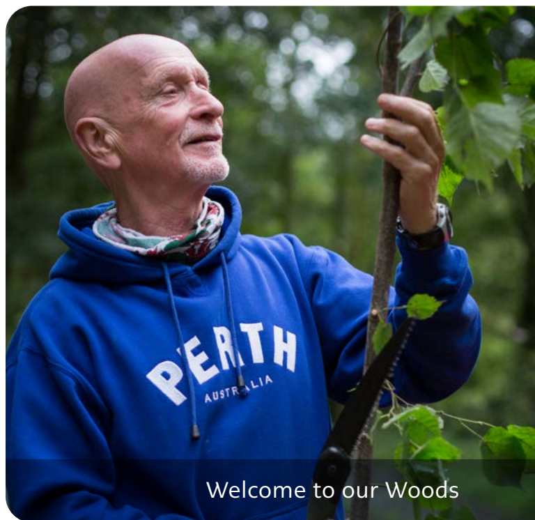
Welcome to our Woods

As lockdown eased and more people returned to work, Team Oxford's focus moved back to engaging with large employers. They created a digital skills audit service to survey employees about their specialisms and skills, allowing for better matches with organisations.