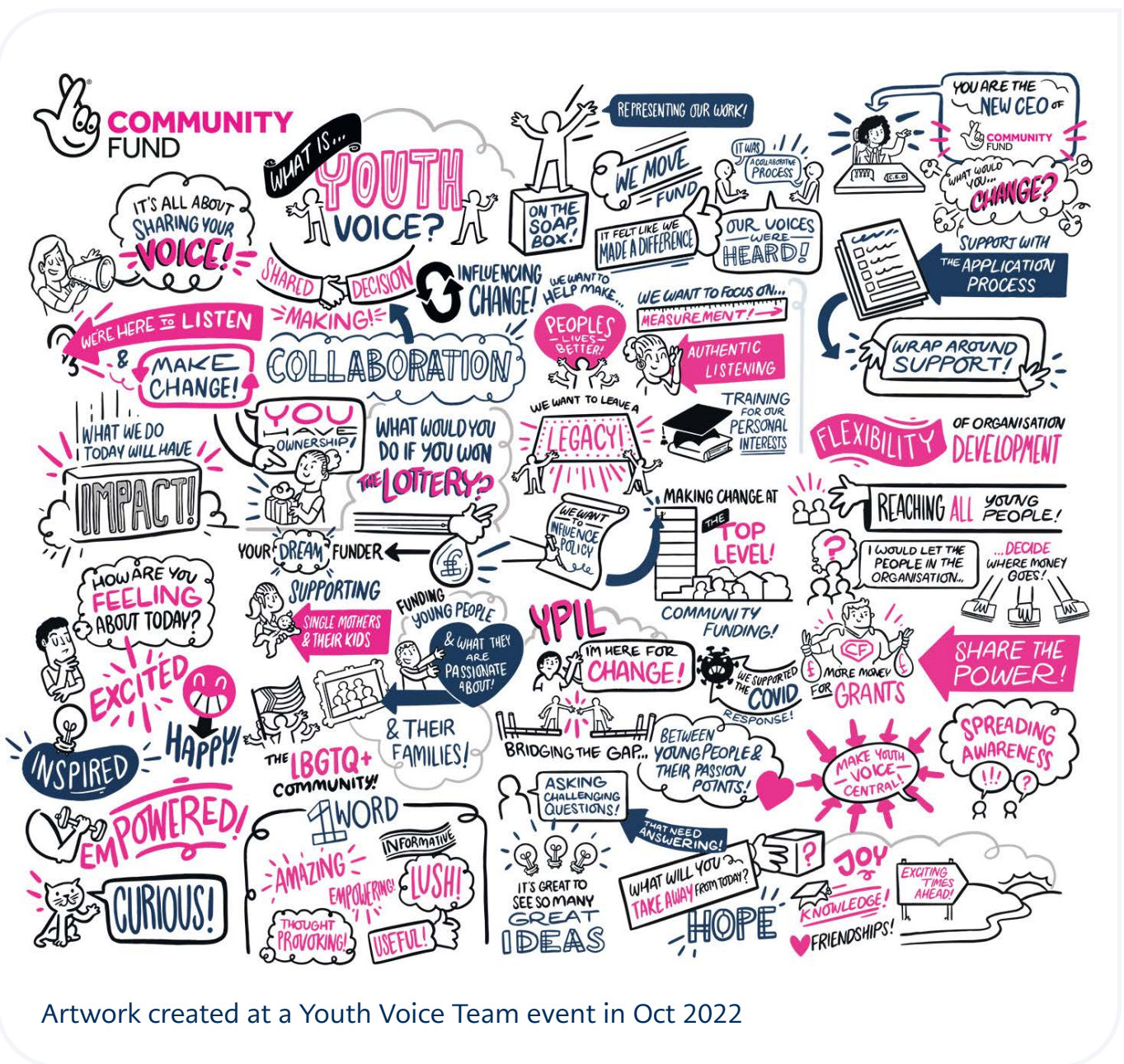
Artwork created at a Youth Voice Team event in Oct 2022

We believe young people represent the diverse communities our funding aims to reach and have Lived Experience of the causes we are focused on helping. To that end, we have built an inclusive strategy with young people, involving them at all levels of our work in ways that suit their lifestyles.