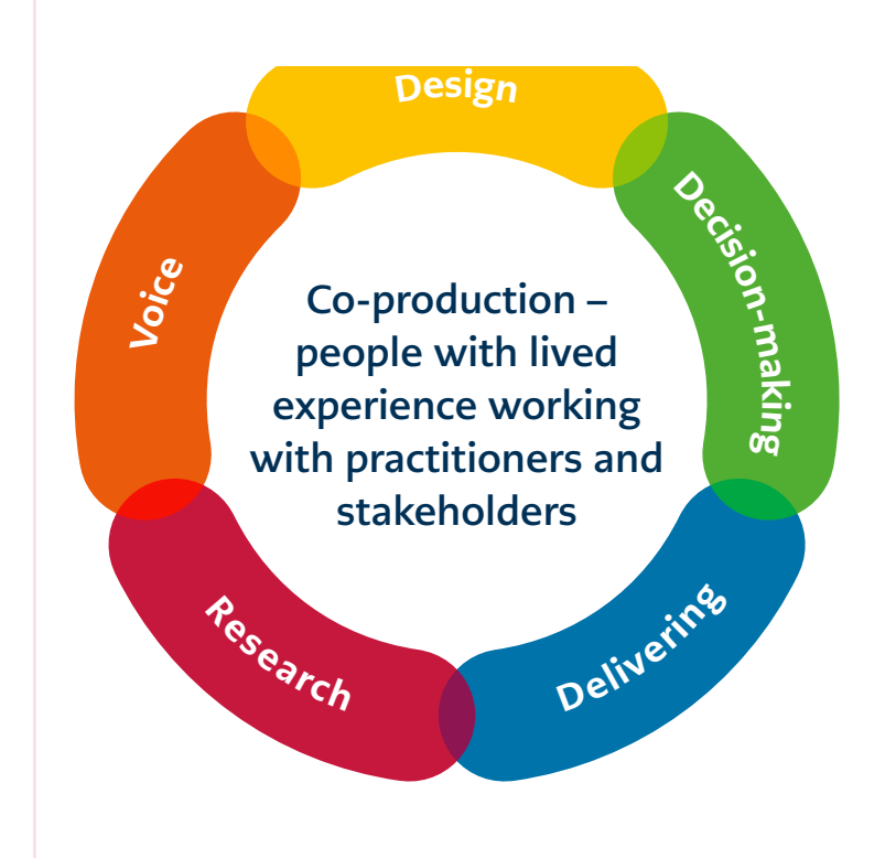
Figure 1. Co-production across the strategic investments

Co-design: influencing what a project or service should look and feel like.